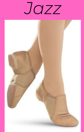
Sparkle Squad Combo 1 & 2