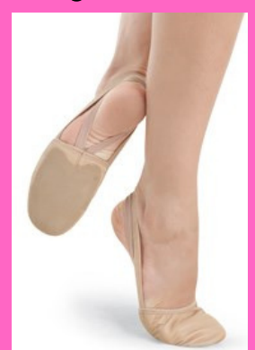
Combo 1 & 2 Skills