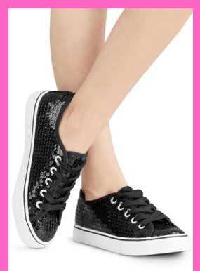
Mini Hip Hop Hip Hop 1 & 2 Combo 1 & 2 *Boys = Black Tennis Shoes *Tiny = White Tennis Shoes