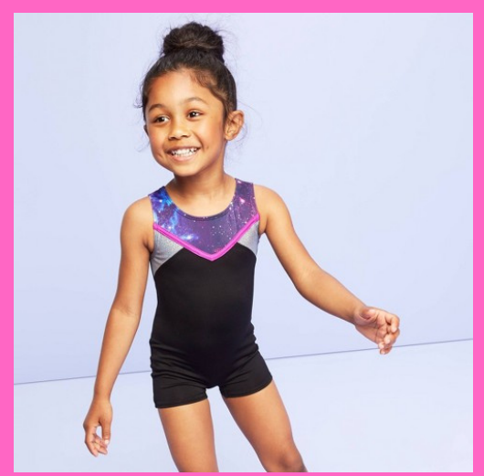
Boutique Hours: By Appointment Only!