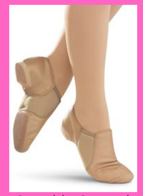
Sparkle Squad Combo 1 & 2